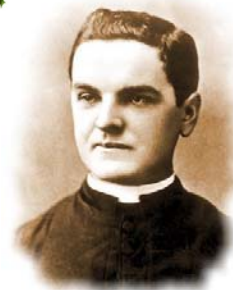
Father Michael J. McGivney Born August 12, 1852 Died August 14, 1890 (age 38) Founder of the Knights of Columbus